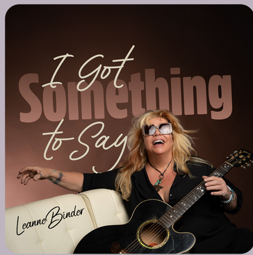
I Got Something to Say