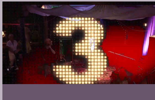
"Little Bitta", Sizzle Reel