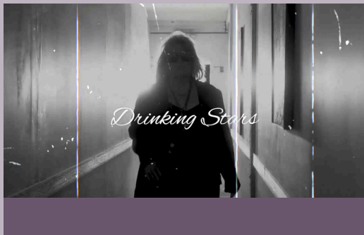
"Drinking Stars", New Single